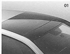
01 Panoramic tilt sunroof.

The importance of comfort and convenience cannot be over-emphasised. Choose from this range of factory-fitted options to create an interior that meets your individual needs, and makes life just that little bit more comfortable and convenient. From a Panoramic tilt sunroof to a Winter pack, these essential luxuries are designed to help you relax and take the stress out of driving, adding not only a touch of luxury, but also providing invaluable practical assistance.