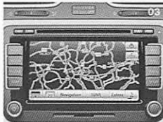
03 DVD touch-screen navigation/radio system.

When it comes to in-car entertainment systems and communications packages, those looking to install a technologically advanced or upgraded system are spoilt for choice. Whether you require concert hall acoustics, or the latest navigation system, these factory-fitted options provide state-of-the-art technology and connectivity. Choose the system that best meets your needs, then sit back and enjoy the benefits.