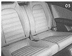
05 'Vienna' leather upholstery.

The interior of your Scirocco is all about aesthetics and luxury, leather upholstery enables you to create a sumptuous interior that is tasteful, elegant and attractive, meeting your needs perfectly, and providing the highest levels of comfort and driving pleasure. Sit back, relax and enjoy your surroundings.